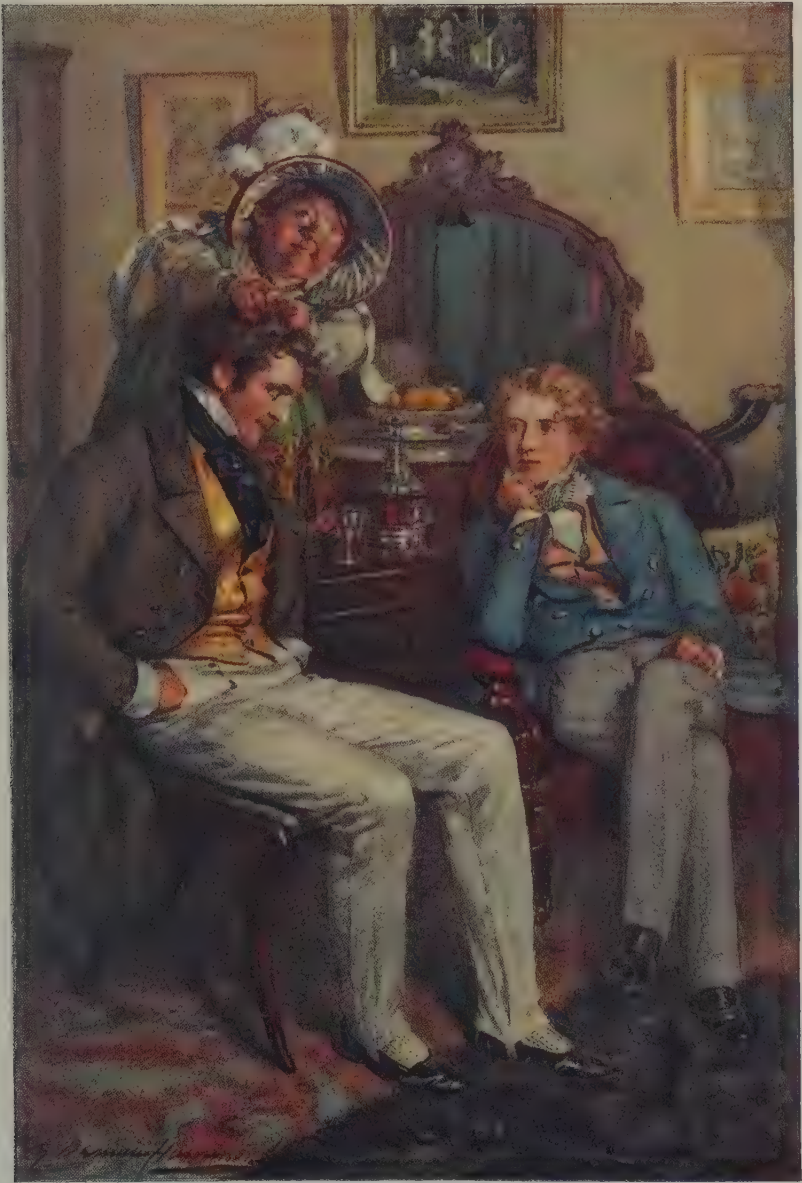
“A SISTER OF YOURS, MR. COPPERFIELD!”